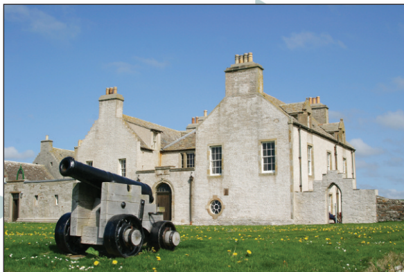
Skaill House is an early seventeenth-century mansion containing lots of interesting artefacts, including the dinner service from Captain Cook's Resolution. It stands guard over Skaill Bay on the west side of Mainland Orkney, on the same site as the famous Skara Brae.