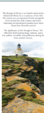
The lighthouse on the tip of the island is an important Pictish stronghold. The island was an important Pictish stronghold from around the sixth century and many interesting archaeological remains have been found here from this period.