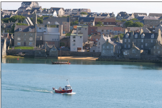
Lerwick in the summer.