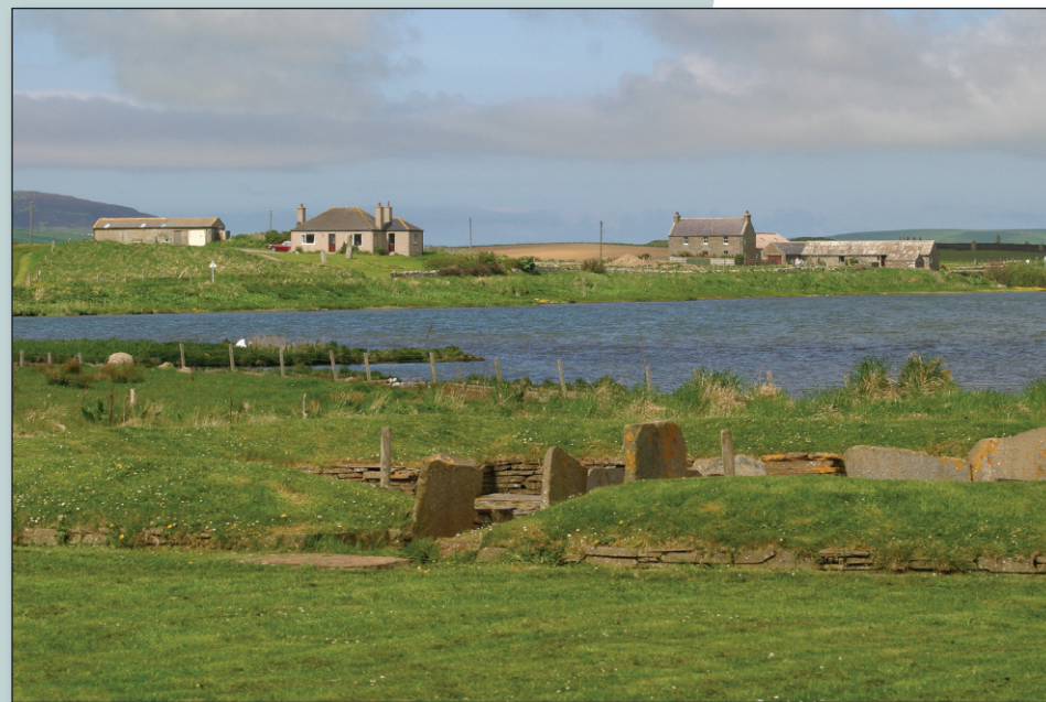
Overlooking the Loch of Harray at Stenness there is a Neolithic village settlement known simply as the Barnhouse. Today all you see is a reconstruction, but it is well worth a visit if you're in the area.