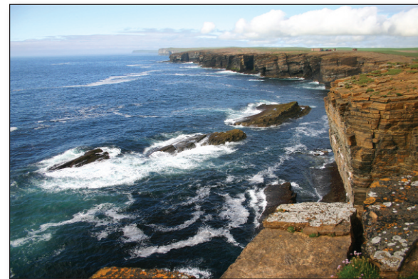
There is some superb seacliff scenery along the coast at Yesnaby, and a walk here should be at the top of everyone's list of ways to get the wind in your hair!