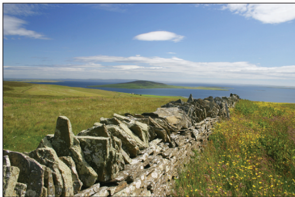
An old stone wall leads the eye off Enyas Hill towards the island of Gairsay, out in Gairsay Sound.